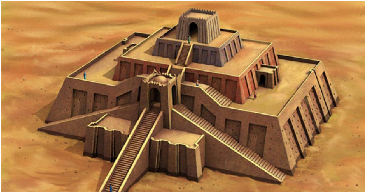
Ziggurat - in current day Dhi-Qar

He prepares all that is needed for His big moves.